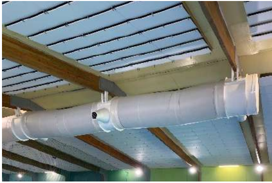
a. Bespoke louvre panel design allowing air flow in the roof cavity