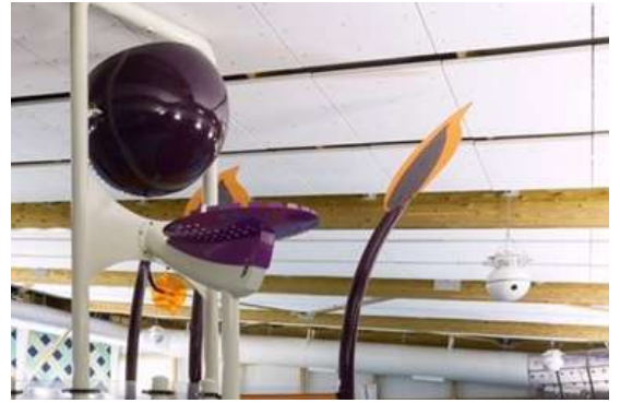
b. Quietspace® Panels with gaps to keep the roof cavity well-ventilated